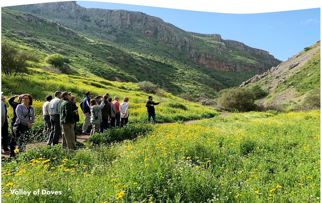
Valley of Doves